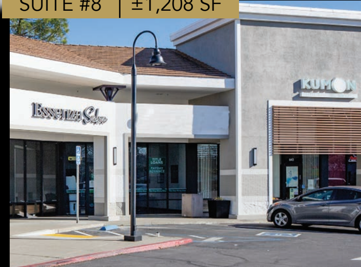
SUITE #8 | ±1,208 SF