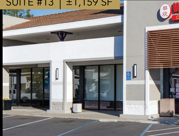
SUITE #13 | ±1,159 SF