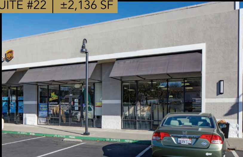
SUITE #22 | ±2,136 SF