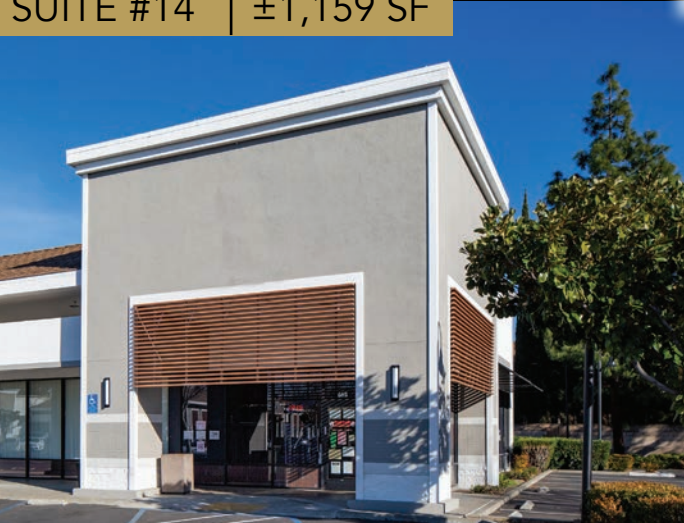
SUITE #14 | ±1,159 SF